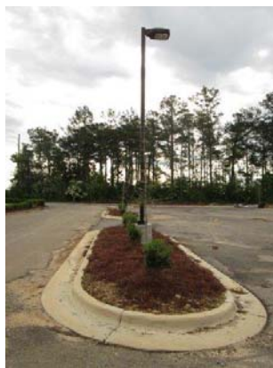
An "Island" in the Front Parking Lot

Good News. We have had significant rains in the past few weeks. I have not seen brown spots on the ceiling in the new building, so hopefully we have a good roof! The only "brown spot" I have seen has not grown larger, so hopefully it is just dirty hands.