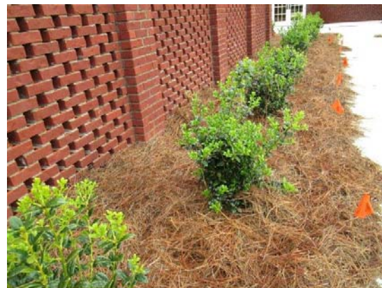
Some of the Beautiful Shrubbery You See When You Enter From The Back