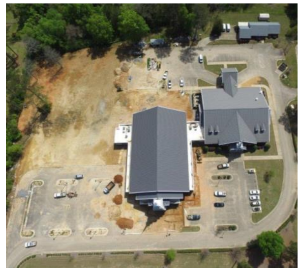
An Aerial View of Eastern Meadows Property

$4,364.00 . See Ted Norton to give on the kitchen.