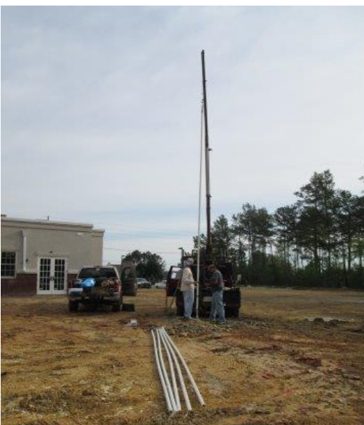
The Well Was Dug Last Week. The Work Continues!

To The Right: A man is walking in the forms for the sidewalks. The white pipes are for the sprinkler system.