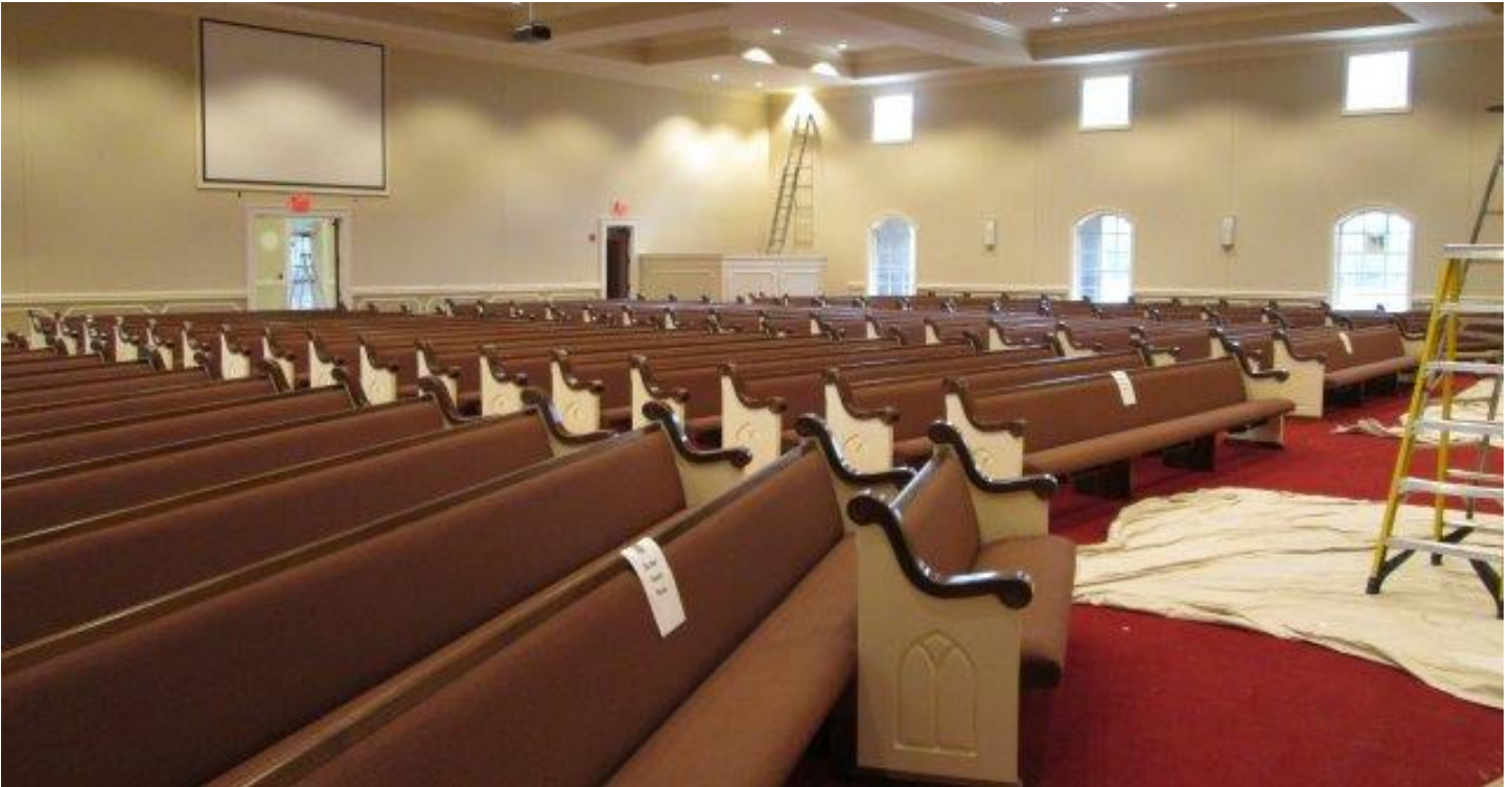
The Pews are bolted down! The small pew in the front will eventually be behind the pulpit.