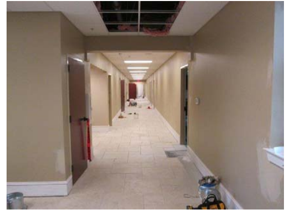
The Back Hallway