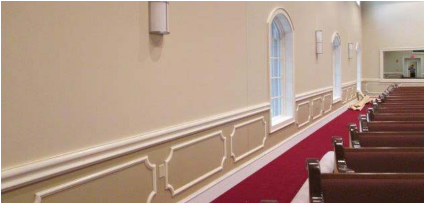
A Wall in the Auditorium Showing the Trim Detail