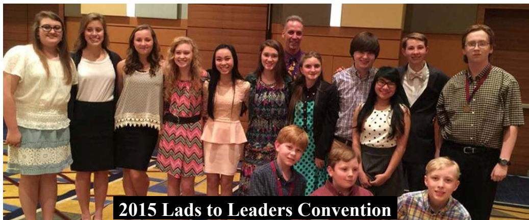
2015 Lads to Leaders Convention