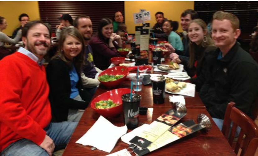
Young Professionals/Young Families