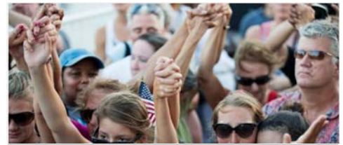
A picture of the June 21 march on Charleston's main bridge.

If Roof thought he would further divide the races by his actions he was very wrong. Thankfully he was wrong. In the days following there was a prayer vigil held at the Emanuel AME church which was attended by as many, if not more, white people than black (just look at the pictures). On Sunday afternoon, June 21, thousands of marchers met in the middle of Charleston's main bridge in a show of unity. And once again, both races participated! Roof's actions brought the races together!