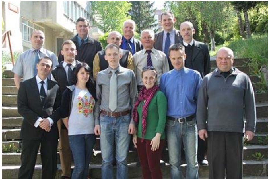
Bear Valley Bible Institute in Ukraine—May 2015

Don't Forget God! Summer has arrived! Vacation! School's out! Yea. Fun. OK. But all of this should not mean that we in any way compromise our convictions. Service and worship to God still rules over fun and the sun. What is modest does not change just because of the temperature. The significance of Sunday, and what we are to be doing on this day does not change because we are on vacation. Don't forget God!